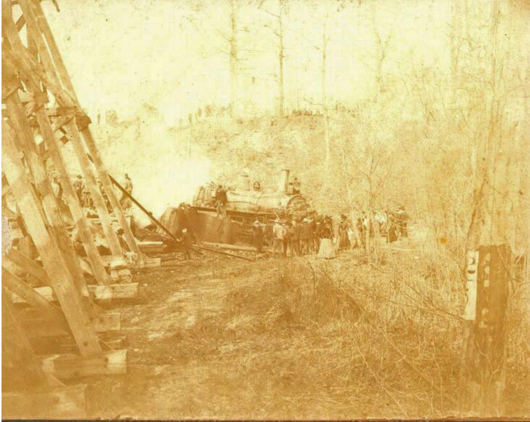
Now what do we do? C Mt. V & C RR locomotive sitting next to Big Walnut creek. A great show for the spectators standing on the hill.